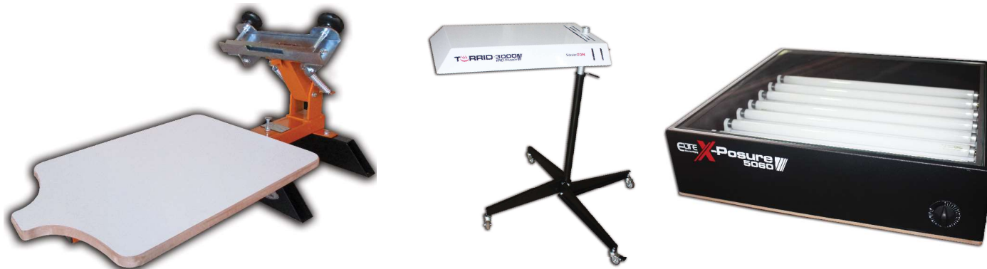
JR.1 JUNIOR -1 PRINTER